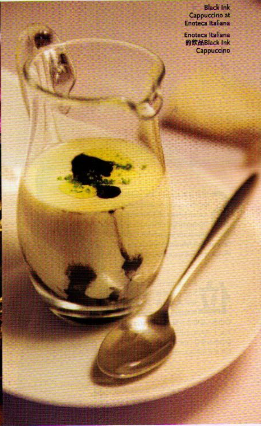
Black Ink Cappuccino at Enoteca Italiana Enoteca Italiana 的飲品Black Ink Cappuccino