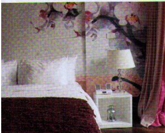
Relax at Bangkok Oasis Spa Bangkok Oasis Spa 讓你身心放鬆