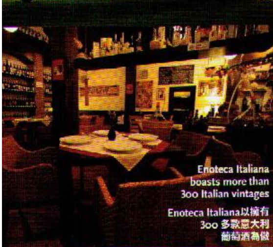
Enoteca Italiana boasts more than 300 Italian vintages Enoteca Italiana以擁有 300多款意大利 葡萄酒為傲